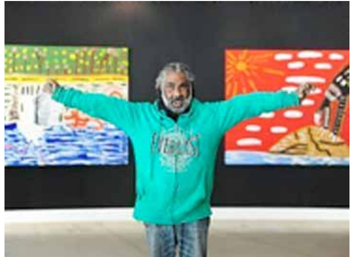
Kangaroo, Dingoes - brothers in arms, fighting for their country by Trevor Turbo Brown